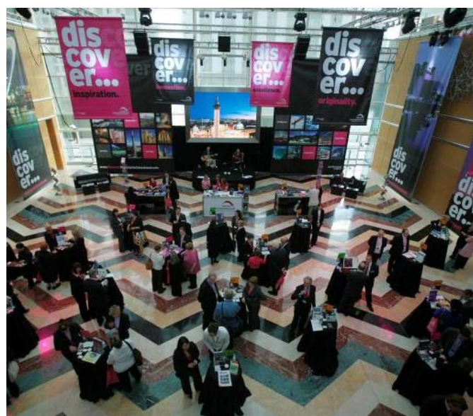
Discover NewcastleGateshead 2008 at East Winter Garden, Canary Wharf